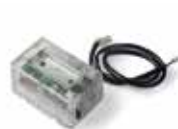
XBA8 Integrable traffic light. Pc./Pack 1