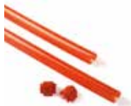
XBA13 Rubber impact protection strip. Length 1 m. Pc./Pack 9