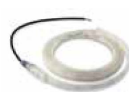
XBA6 Indicator lights for click fixture on upper or lower side of bar. Length 6 m.