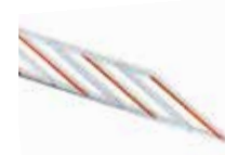
WA13 Aluminium rack up to 2 m.