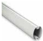
XBA5 White paint-finished aluminium bar 69x92x5150 mm.