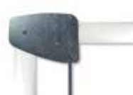
XBA11 Joint for bars (from 1950 mm to 2400 mm).