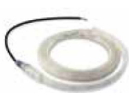
XBA6 Indicator lights for click fixture on upper or lower side of bar. Length 6 m.