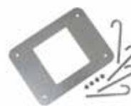
XBA16 Anchorage base with clamps. Pc./Pack 1