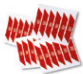
WA10 Red adhesive reflector strips. Pc./Pack 24