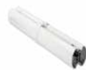
XBA9 Expansion joint.