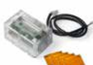
XBA7 Integrable flashing light. Pc./Pack 1