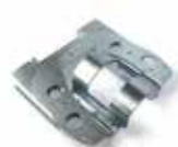
XBA10 Pivot joint for bars up to 4 m.